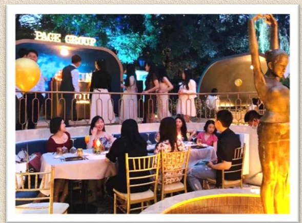
Summer party hosted by company