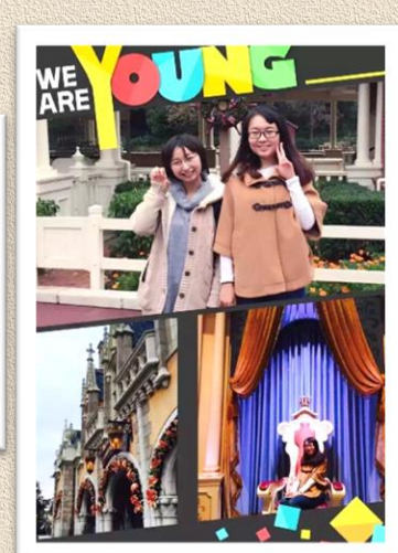
Memory with my teachers and friends in Japan