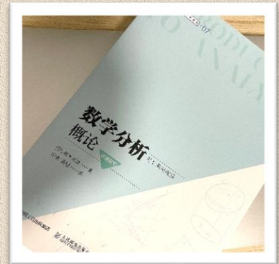
A classic Japanese calculus textbook published in Chinese