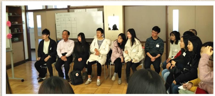
Gather and spend time together in the classroom