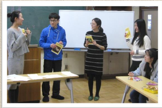
Japanese Corner with classmates