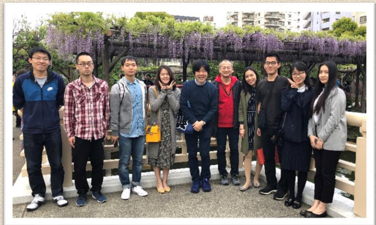
Small excursion in Tokyo 2018