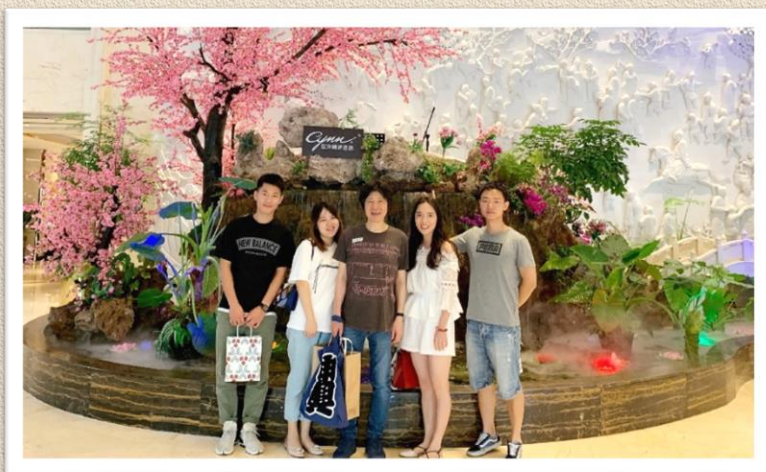
Reunion in Chengdu 2019