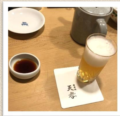
Eating Tempura with Abe sensei