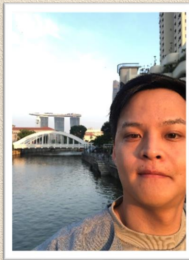
Traveling Singapore before COVID-19