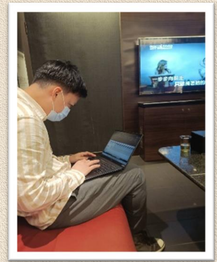
My current days is like... (Still working when going to Karaoke)