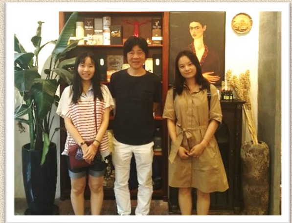
Reunion in Beijing 2018