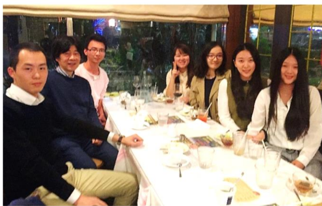
Party in Tokyo 2015