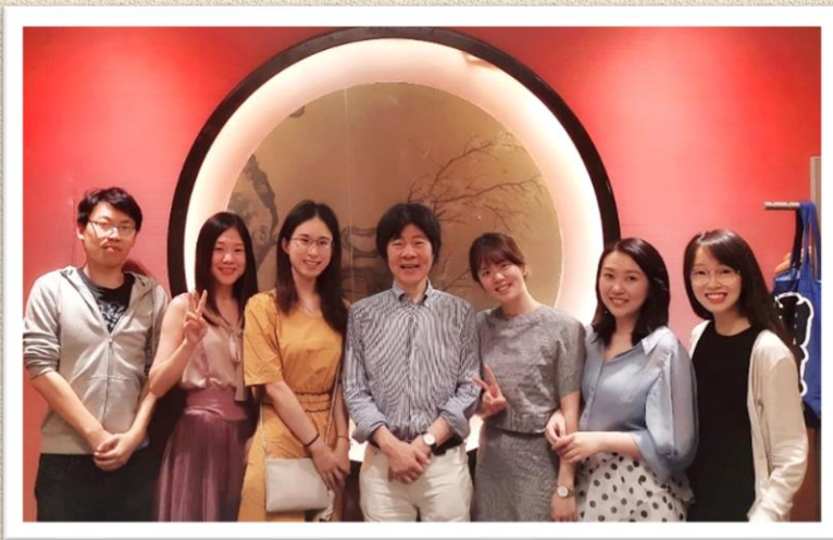
Reunion in Beijing 2019