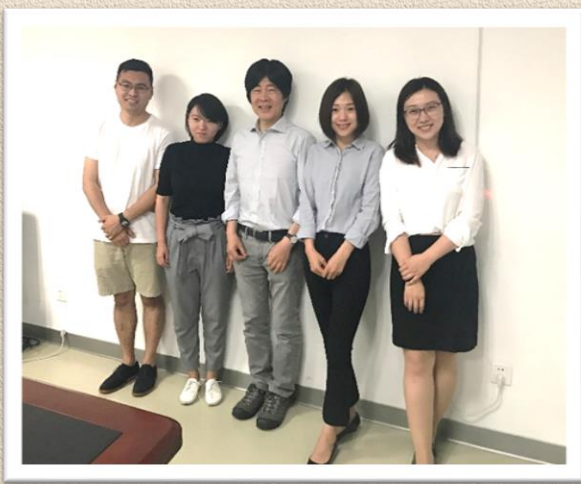
Reunion in Beijing 2016