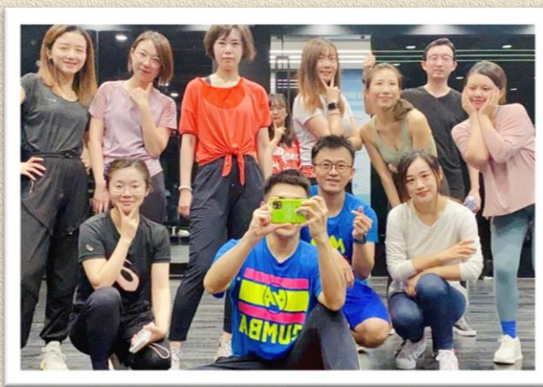
Doing exercise to keep fit