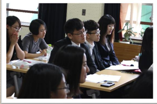
The first day of IGSAP