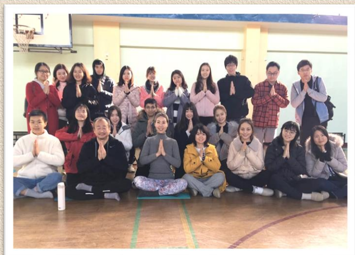
Try Yoga with classmates