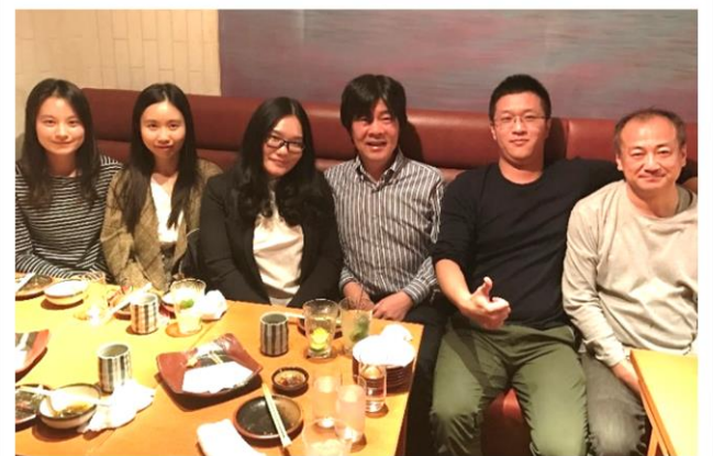
Party in Tokyo 2016