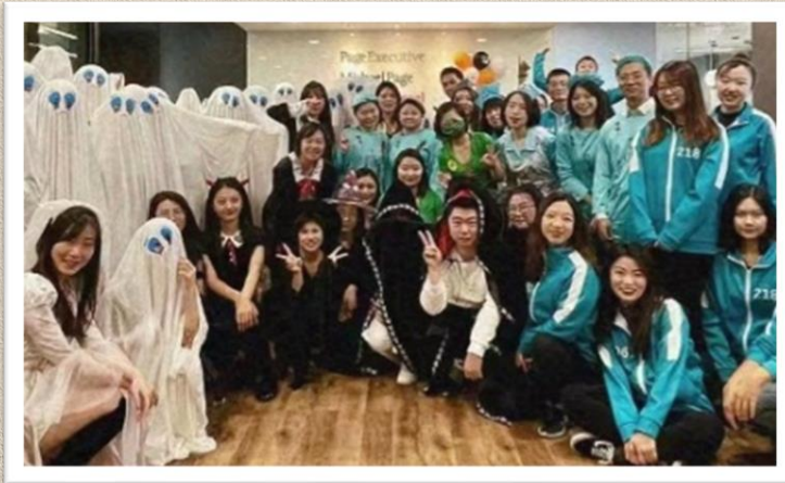
This is my company Halloween event, all of the employees made Cosplay