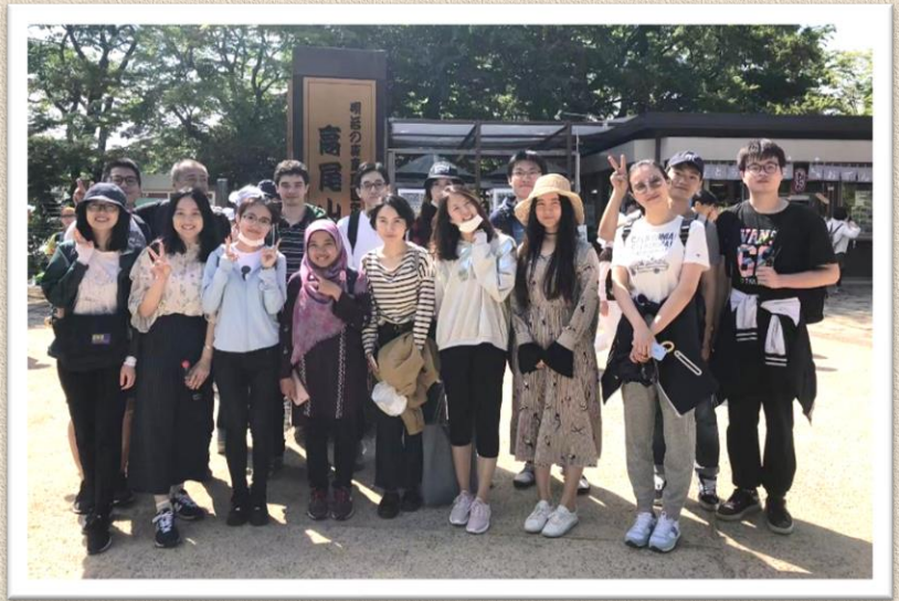
Hiking with classmates