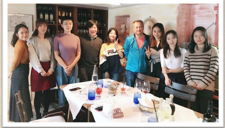
Party in Tokyo 2018