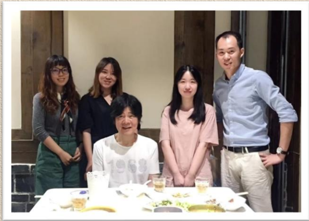
Reunion in Chengdu 2018