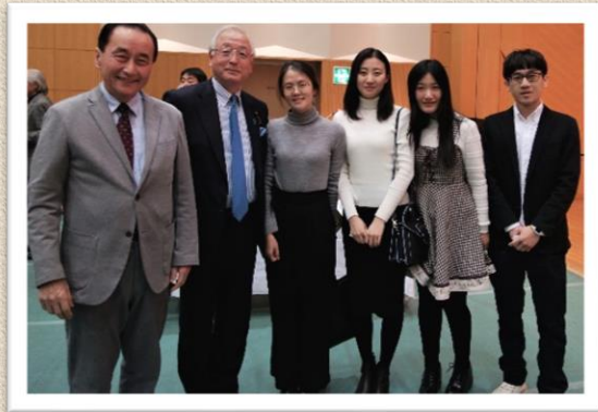
Greeting exchange party