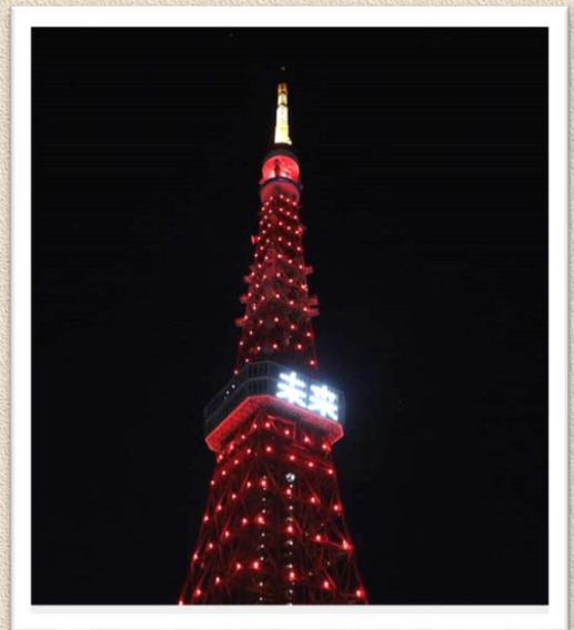
春節色 Lunar New Year Colour