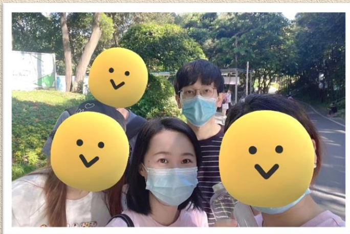
Hiking with relatives