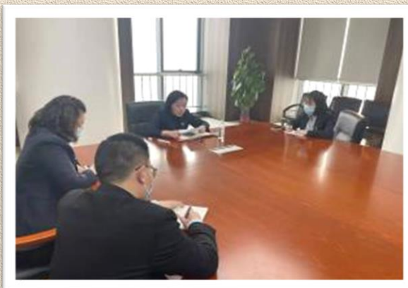
With my bosses and colleagues