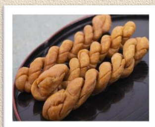
Famous traditional Tianjin sweets