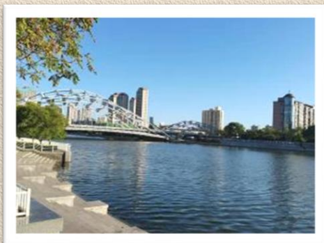
Tianjin landscape, Welcome to Tianjin!