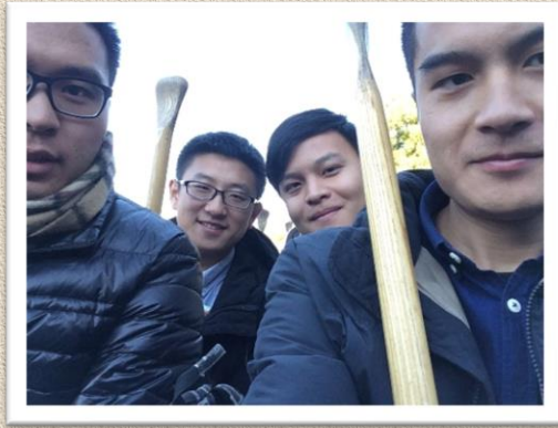
With IGSAP classmates in Disneyland